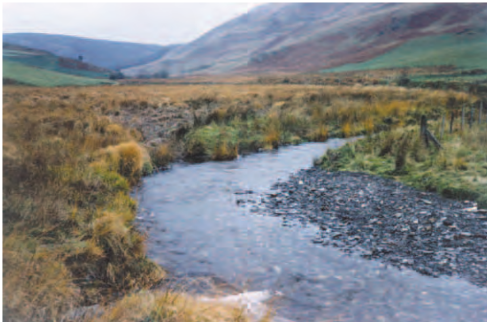
Photograph A for Question 2